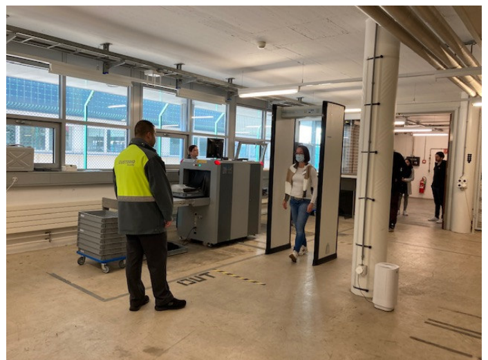
Figure 5: Film scene of a normal security check

Finally, seventeen suitable scenes of normal and deviant behaviour were selected from all the video material created and edited into a video of about twenty minutes and prepared for the experimental measurements.