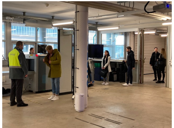
Figure 4: Film scene with metal alarm

Finally, seventeen suitable scenes of normal and deviant behaviour were selected from all the video material created and edited into a video of about twenty minutes and prepared for the experimental measurements.