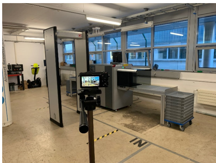
Figure 3: Position of camera 1

The overall objective of the experiment is to determine scientifically whether specialised further training of private security personnel at Swiss airports can contribute to a better recognition of offender-specific behaviour of assassins in the predicate phase by security bodies. This could prevent the perpetration of an attack in the main phase. In order to answer this question and to conduct the experiment as described, a large amount of video material at staff security checkpoints is needed. For data protection reasons and due to the lack of scenes of deviant or potentially suspicious behaviour at real security checkpoints, CCTV footage could not be used for this purpose. Consequently, the required video footage was created during filming at a training staff security checkpoint line with the assistance of students from Kalaidos University of Applied Sciences (see fig. 3-5). The students acted as lay actors and performed various normal as well as deviating scenes at staff security checkpoints. In addition, they gained valuable insight into a current research project including research logic/design and questions during their studies. The scenes were filmed and saved using state-of-the-art video technology from three different camera perspectives (from the front, from the side and from behind).