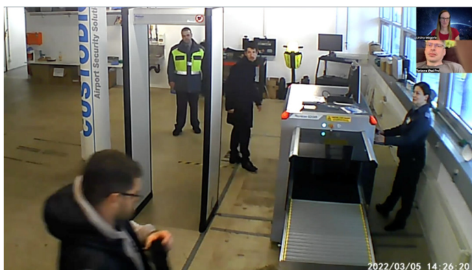
Figure 6: Zoom online session with a test person

As you can see, ladies and gentlemen, dear colleagues, a lot has already been done. Other important steps such as the implementation of the training and the second measurement of the search behaviour are still to come. Finally, the statements of the test subjects regarding behaviour deviating from the norm at both time points must be transcribed and evaluated with regard to answering the question of whether behaviour deviating from the norm is better recognised after the training than before. So it remains exciting and we will report on the results in the next newsletter. We thank you very much for your individual contribution and your interest in our research!